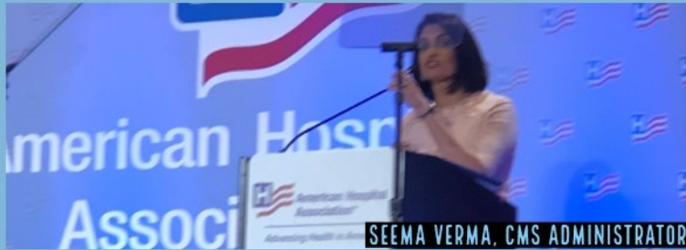
SEEMA VERMA, CMS ADMINISTRATOR